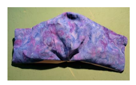
Trim the corners and then turn the mask inside out.