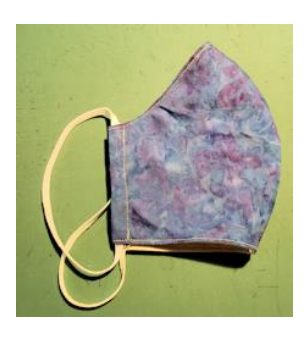
You are finished!