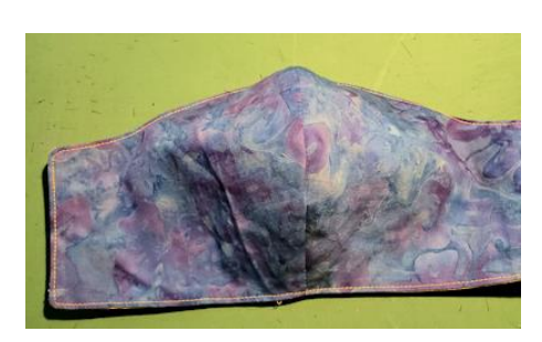
• Top-Stitch along the edge.