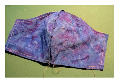
Sew the two pieces together (with a ¼" seam).