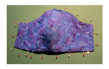
Pin the edge of the mask (front side, shown above).