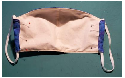
Fold each side about ½" and tuck an elastic band under each fold.